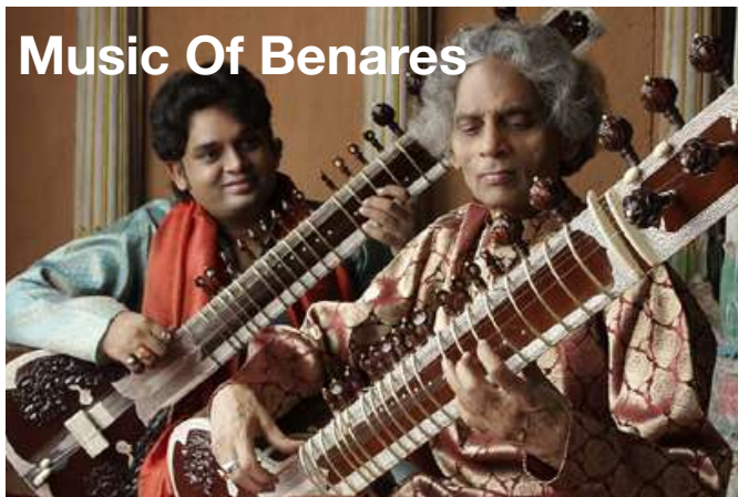
Music Of Benares

https://www.youtube.com/watch?v=T96X257I_Kc https://www.youtube.com/watch?v=YqtHLxJR0n0 https://www.youtube.com/watch?v=lddGQ2RaW70 https://www.youtube.com/watch?v=-xzEh0bQ4dw https://www.youtube.com/watch?v=FMkDVRcCepo