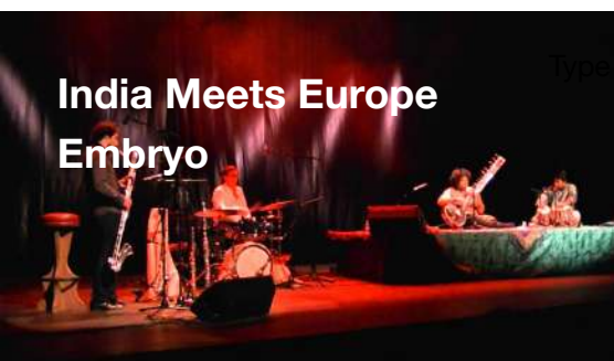
India Meets Europe Embryo